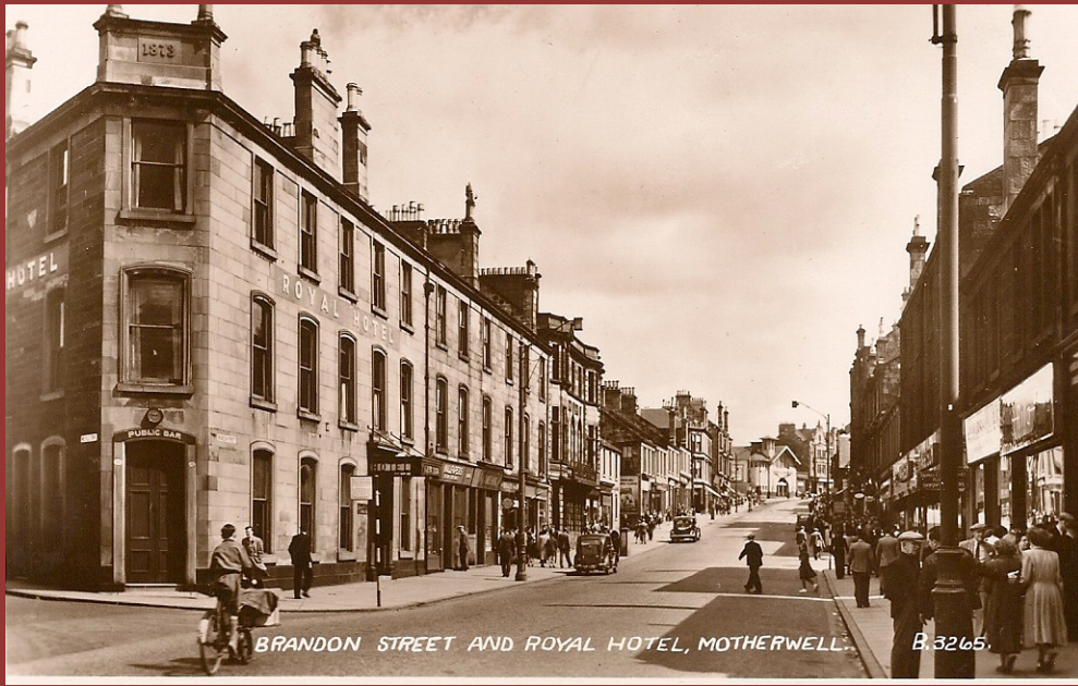
Brandon Street with the Royal Hotel on the left