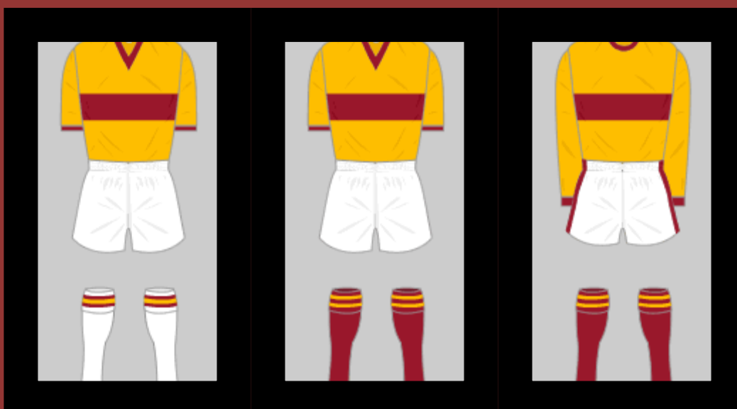
1959/60 (away socks)