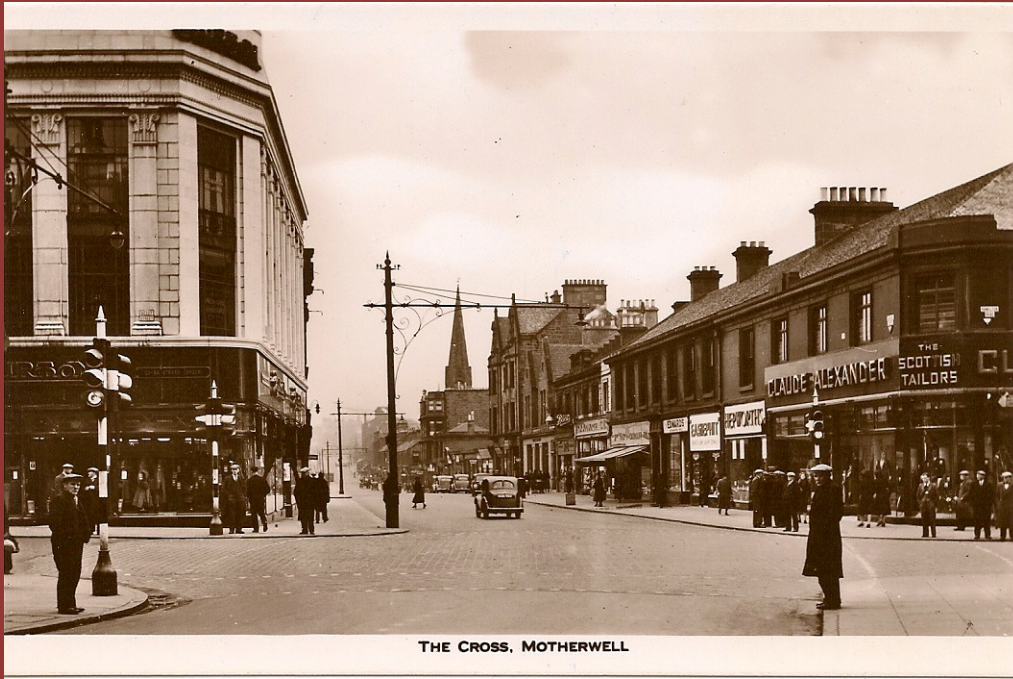
Looking up Brandon Street from Motherwell Cross