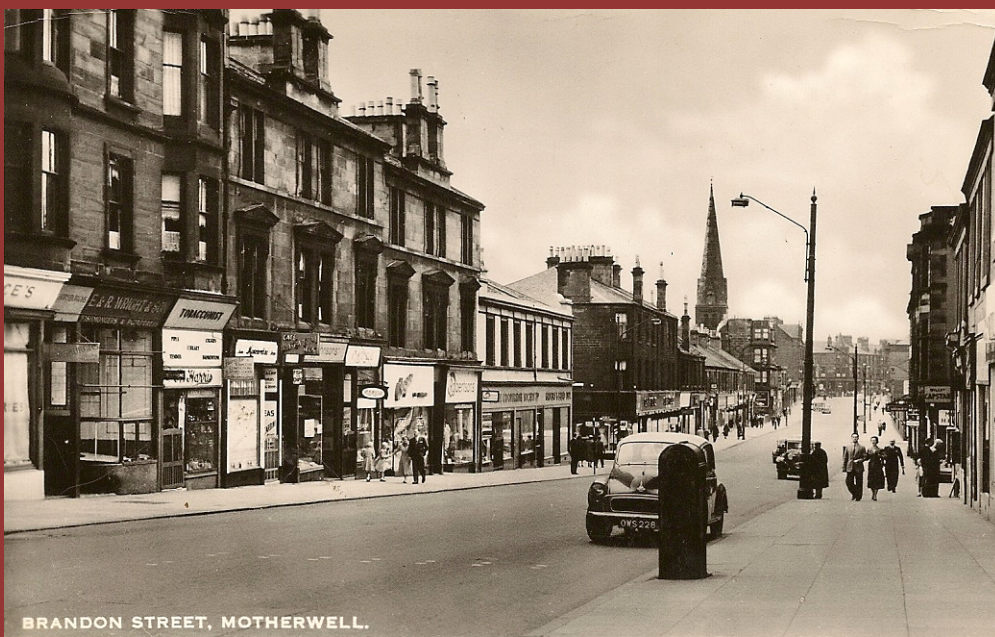
Brandon Street towards the Cross from near the Odeon Cinema