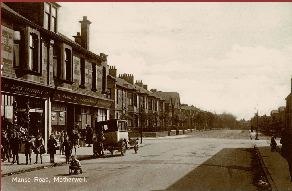
Manse Road with the Fir Park Ice Café c.1932