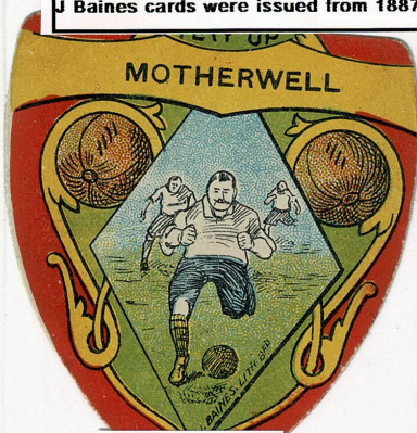
J. Baines c.1897

J Baines cards were issued from 1887 until just after WW1 and sold in packets of 6 for 1 halfpenny